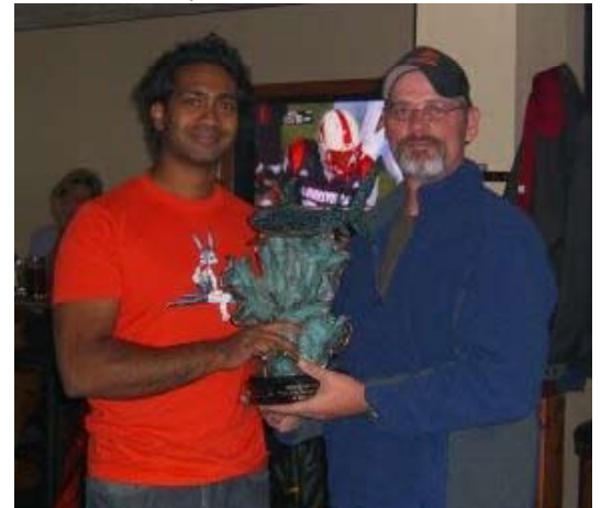
Snell and Wilmer's team won the 2006 tournament