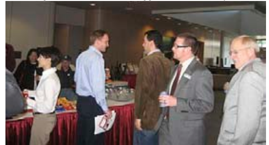
Students and attorneys socialize during the break