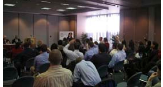
Mentoring Marathon 2008, the biggest and the best yet!