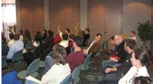
Mentoring Marathon 2008